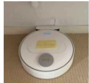
Co-worker name: Alan

Skills: Always desperately needing to go outside 1 minute before a Zoom meeting starts. Available to soak up sunshine and snuggle on the couch.