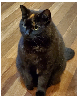
Co-worker name: Puss Puss

Skills: Meticulous about cleaning up after himself.