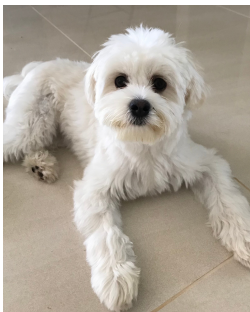
Co-worker name: Josie

Skills: Original creator of a zoom meeting game which starts just after a meeting does by complaining by the back door to be let inside, once inside complaining by the front door to be let out - to loop around to the back door to start again.