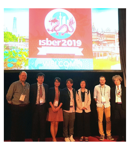
The Special Topics Session: Biobanking in Asia and Oceania panel.